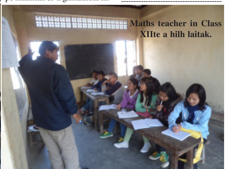
Maths teacher in Class XIIe a hilh laitak.

Hiai a limte kimvek kei mahleh Subject lakdan zil a limlak uh ahi a, teachers leh students khenkhat telkha lou uhi. A vaveh thei zel omleh tha pe mahmah di'n gintakhuai hi.